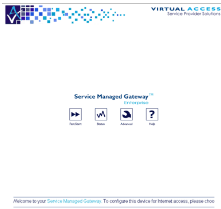
Figure 1: The SMG start page

When your Service Managed Gateway is correctly connected to your PC, type fast.start into the URL line of your browser to display the Start page.